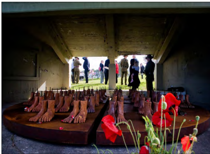
Figure 3: Helen Pollock Victory medal 2010. Terracotta, bronze, rusted steel; diameter 4800 mm, height 460 mm

the ceramic feet, which are still rough, unprocessed clay, even after firing, suggest conformity – and disposability. In contrast, the bronze feet are enduring and ritualistic, symbolic of a 'recognised hero'. But suffering and death are indiscriminate – they respect no hierarchies – and in Victory medal Pollock acknowledges all of our heroes, all of those men and women whose lives were lost or blighted by circumstances beyond their control.