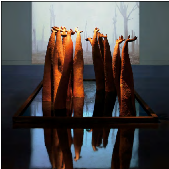
Figure 1: Helen Pollock Falls the shadow 2007/08. Terracotta, rusted steel, water, text; 1600 × 2200 × 4800 mm

Falls the shadow (Figure 1) is a contemplative work comprising 18 arms that reach out from a reflective pool and symbolise the 5,000 New Zealanders who lie forever in the battlefields of Flanders. Displayed in a darkened room against a barren background, these gestures of futility and of hope are accompanied by text and an evocative soundscape of the shovelling and sloshing of clay, distant thunder, rain, wind, and birdsong. Installed in its dedicated space at the Passchendaele Memorial Museum, Falls the shadow is the culmination of an immersive experience for visitors who wind through rooms of remembrance and are then channelled along the narrow twists and turns of underground trenches, re-creations of front-line conditions in WWI. The museum focuses on the part played by the Allied forces in the Battle of Passchendaele where, on October 12, 1917, 846 New Zealand soldiers were killed in just two hours, making it the bloodiest day in Aotearoa/New Zealand's history.