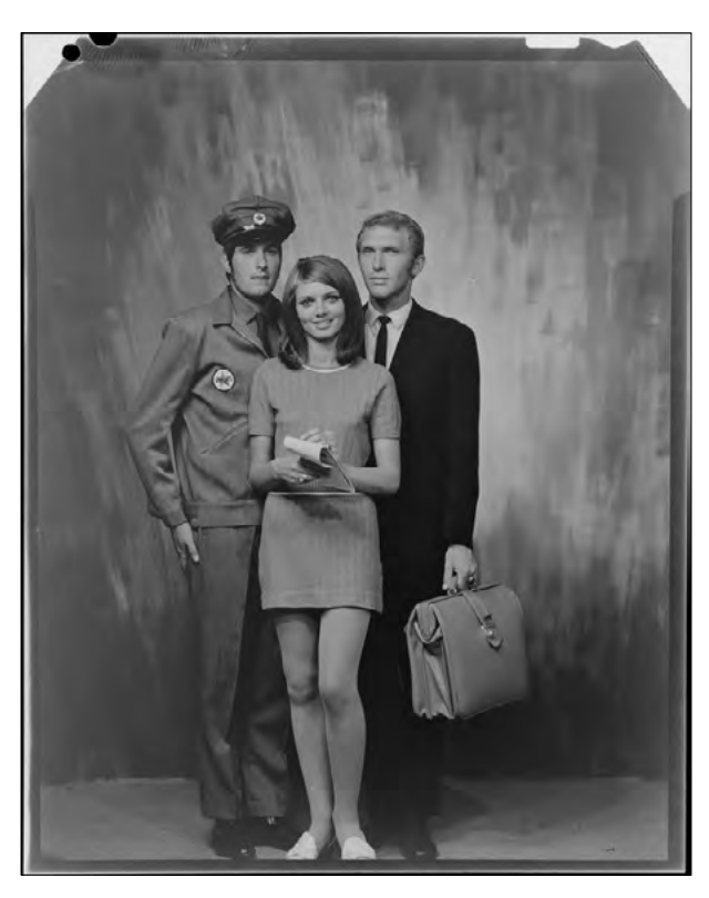
Figure 7. Dormer Beck Caltex Campaign, 1970.

In Figure 6, the women themselves appear to be part of the wall. Each woman can be thought of as a brick within this wall, cemented together by their identical uniforms and appearance.