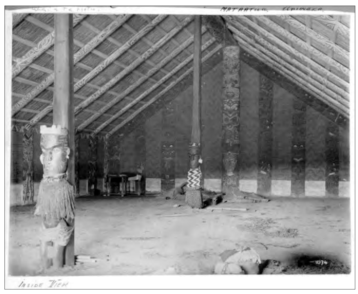
In Figure 1, what is most striking is the lack of divisional walls. The structure of the wharenui symbolises the embracement of the collective whānau, and has been built to resemble a living body: the tāhuhu, or ridge beam, is the backbone; the heke, or rafters, are the ribs; and the poutokomanawa, or central column, is the heart (Brown, 2014).