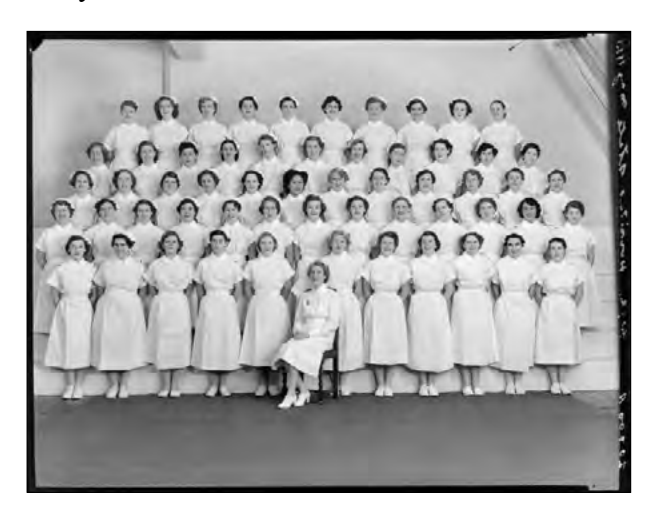
Figure 6. Nurses, Wellington Hospital, 1953.

In the photograph of Massey Veterinary College (Figure 5), the power and privilege of the structure are evidenced by the wall height, the generous electrical lighting, the portraits on the far wall, the trophies, and the bookcases lined with heavy texts. The postures of the men are confident and relaxed. In the far right is a woman, though we barely see her – she is turned away from the camera, not called into view.