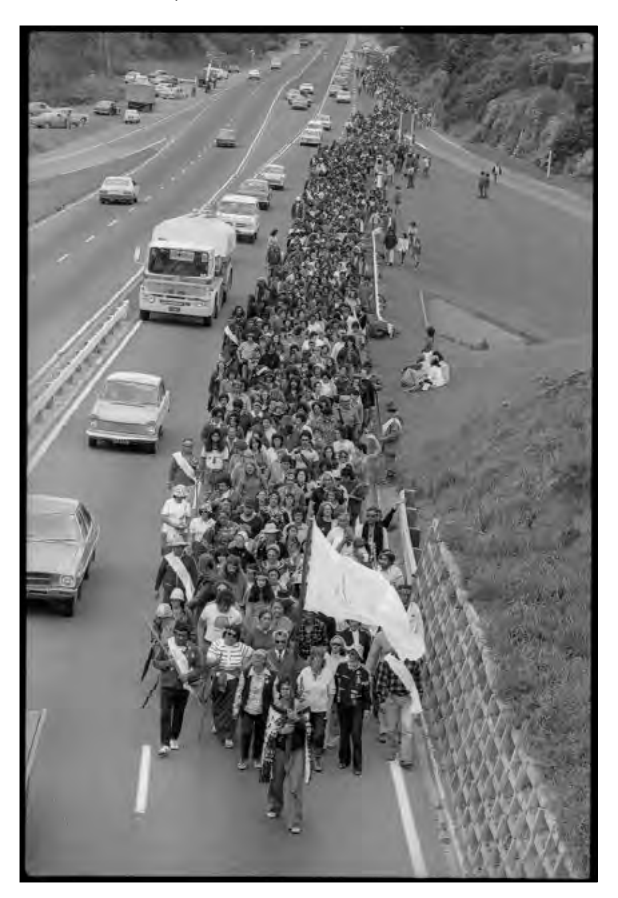
Figure 9. Maori land march, Porirua motorway, 1975.

Heterosexuality, marriage, the nuclear family, religion, morality, education, advertising, politics, health-care, policing, prisons, psychology, and many other structural, discursive institutions are imbued with explicit and implicit 'traffic rules.' Furthermore, what these rules are, and what it means to break them, are insolvably tied to economic systems (Inglehart & Baker, 2000).