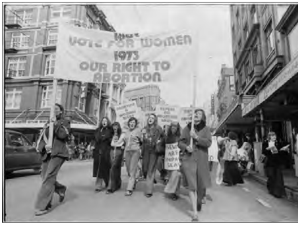
Figure 10. Women marching to protest against the abortion laws, Willis Street, Wellington, 1973.

Figures 9 and 10 visually present such embodied disruption of traffic systems. The provocation of the protestors necessarily occurs within a neoliberal context which thrives on the privatisation and individualisation of poverty, discrimination, and crime (Roberts, 2014). Thus, activism involves collectively getting in the way of mechanised systems, occupying spaces which were not intended for certain bodies. In her summary of intersectionality, Ferguson (2017) laments the description of intersectionality through an 'unfortunate traffic metaphor, wherein intersections are discrete points where lines cross' (p. 271). She suggests, instead, the metaphor of a 'sprawling marshland fed by many different resources, which themselves shift and pulse within larger mobile systems of tides and currents' (p. 272). Her imagery does offer a welcome sense of breadth and multiplicity to intersectionality, but it undermines the material realities of human existences, as they tend to be situated amongst built structures.