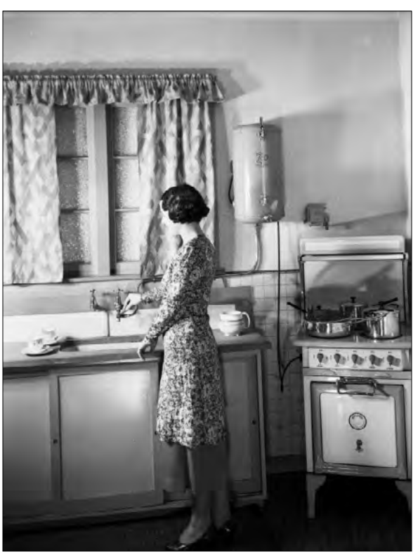
In Figures 3 and 4, the Pākehā women are facing away from the camera, and their bodies are positioned into passive, powerless poses. Through the photographer's gaze, we have the